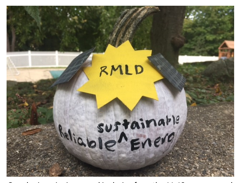
Grand prize-winning pumpkin design from the 11-13 age group submitted by Clara Healy, age 13, of Reading.

Grand prize-winning pumpkin design from the 8-10 age group submitted by Logan Chau, age 8, of North Reading.