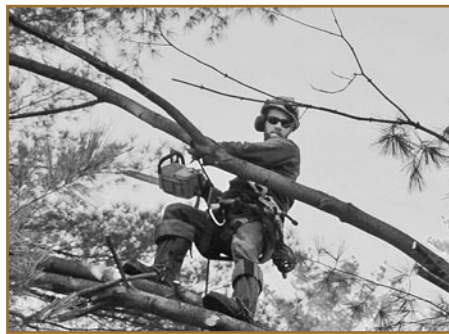
RMLD crews worked around the clock to clear trees that caused damage during the nor'easter.

We know you want information faster and we are investigating providing that to you through social media outlets like Facebook and Twitter. We are in the process of upgrading meters in the four towns and these new meters will eventually have the potential of notifying our Control Center that your home or business has lost its power, even if you're not on the premises. We hope these services will demonstrate to you that reliable service to you is our priority at all times.